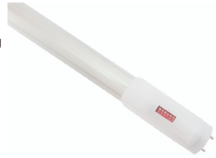
Model : LT-I1218-SL-BT